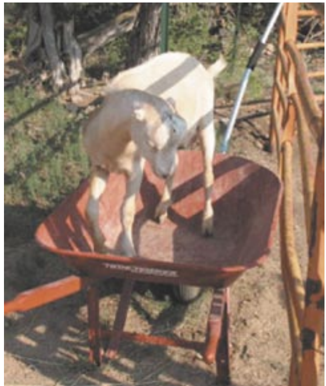
Isaac playing in a wheelbarrow.

http://www.allcreaturesmemorialpark.org/IsaacsFund.html