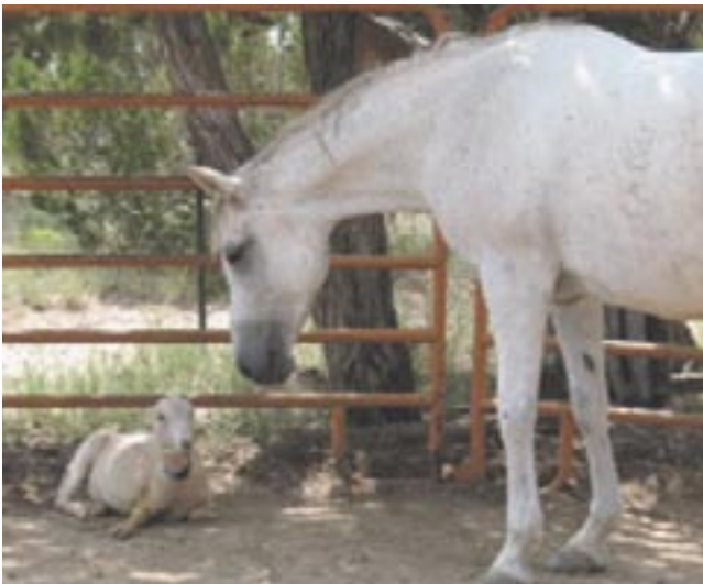
Isaac and Zoey enjoying a quiet moment.